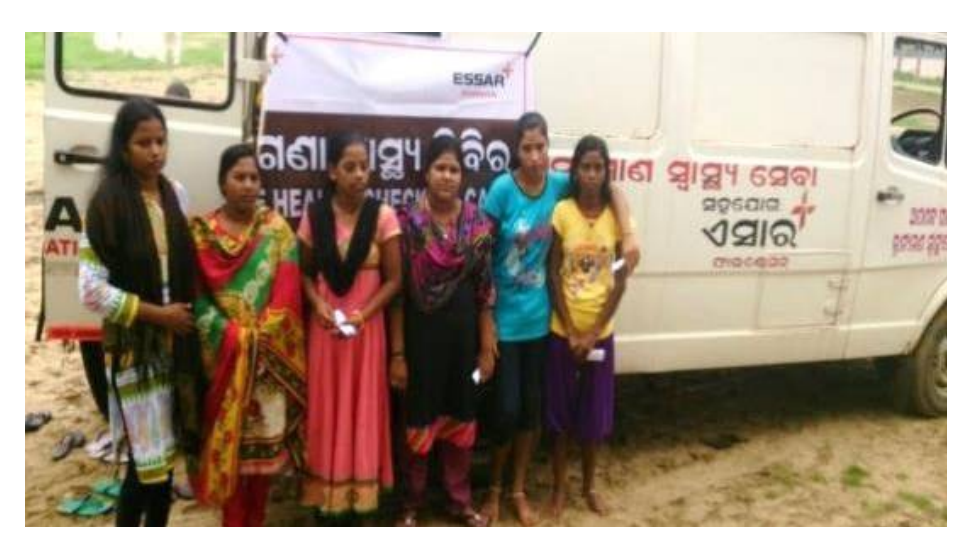
(health workers), Anganwadi and ASHA workers attended the program.

A health checkup and awareness camp was organized on menstrual hygiene for the adolescent girls in Chakradharapur village, Paradeep on 5th November, 2016. The MMU team led this special awareness programme on personal hygiene among women and girls. 68 girls participated in the camp. The ANMs