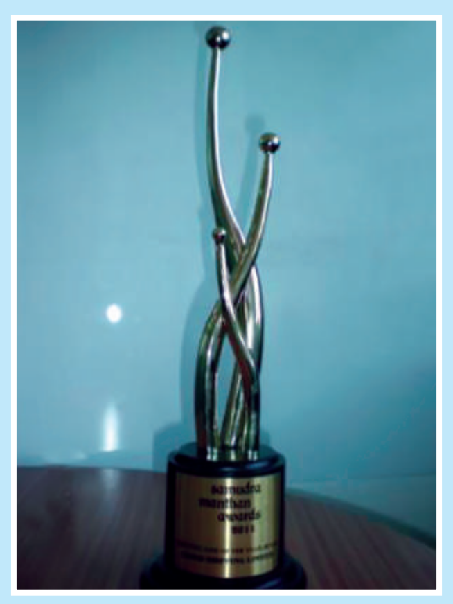
Essar Shipping Limited has won SHIPPING LINE OF THE YEAR (BULK) AWARD at Samudra Manthan Awards 2011